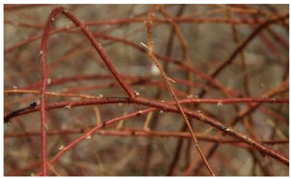
Figure 1: Wineberry canes