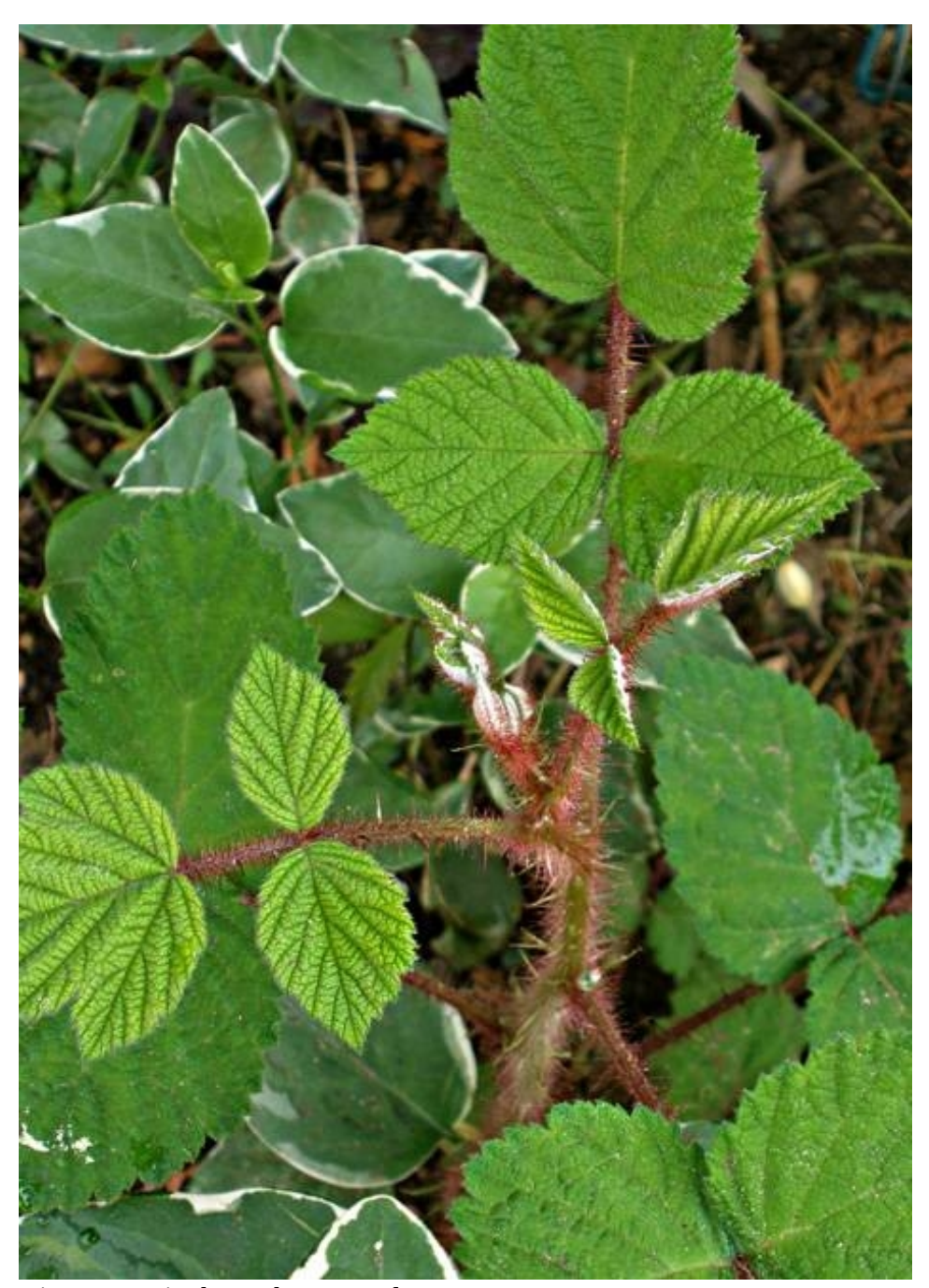
Figure 3: Wineberry leaves and stems