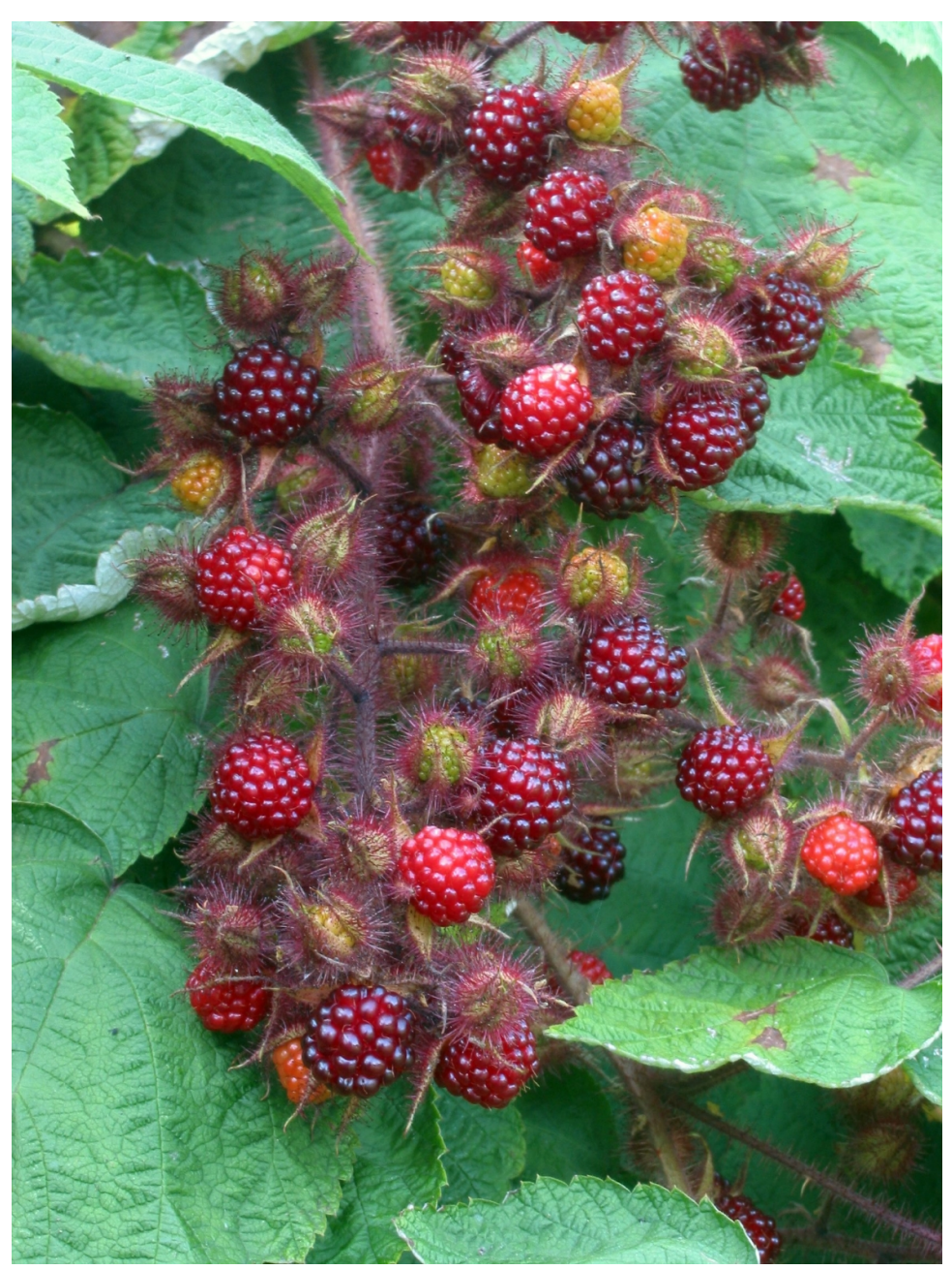
Figure 4: Wineberry fruit