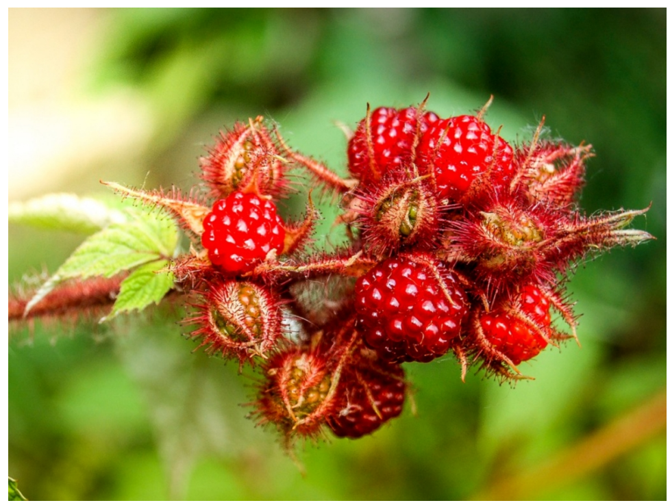
Figure 5: Wineberries are vibrant glossy red