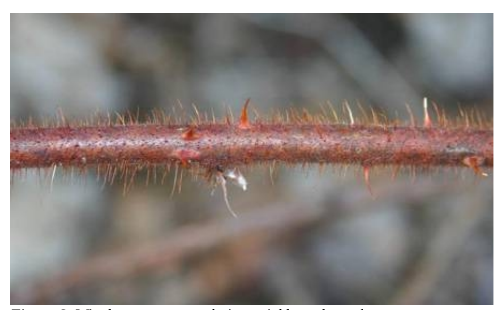
Figure 6: Wineberry stems are hairy, prickly and purple